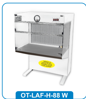
OT-LAF-H-88 W HORIZONTAL MODEL