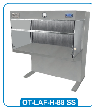
OT-LAF-H-88 SS LAMINAR AIR FLOW (S.S. BODY)

The body is made of Wooden / M.S. Duly Powder Coated / S.S. Body. With all accessories which are: