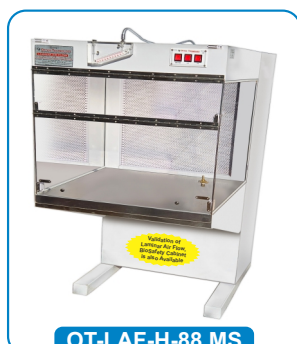
OT-LAF-H-88 MS LAMINAR AIR FLOW (M.S. BODY)