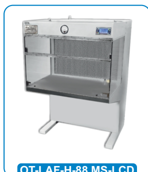
OT-LAF-H-88 MS-LCD LAMINAR AIR FLOW (M.S. BODY)