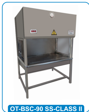
OT-BSC-90 SS-CLASS II