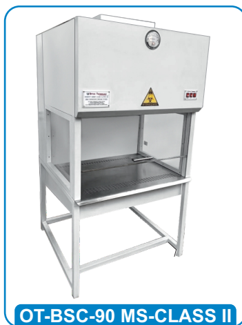
OT-BSC-90 MS-CLASS II