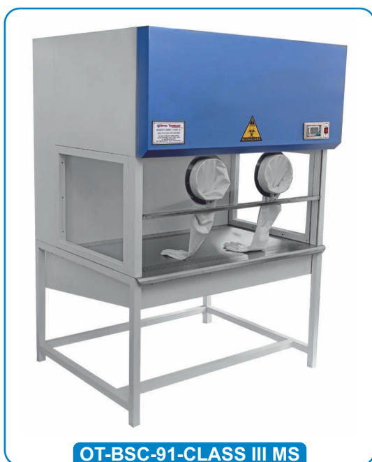
OT-BSC-91-CLASS III MS

“OPTICS TECHNOLOGY” Class III Bio safety cabinet offers the highest level of operator, product and environmental protection from infectious/biohazardous aerosols and is suitable for microbiological work. Designed for an absolute level of containment, it is frequently used for work involving the deadliest bio-hazards.